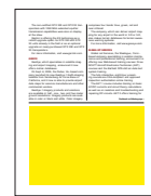
Half Page 6 1/4" x 4 1/4"