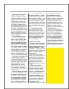
1/6 Page 2" x 4 1/4"